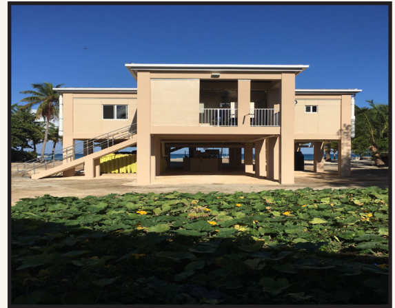
Coast Guard Station, Dominican Republic

AKEA would be honored to discuss how we can provide you with the best solutions to your construction and service needs.