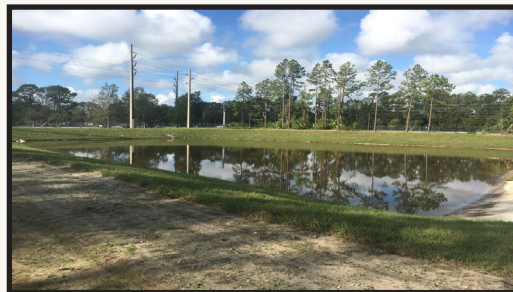
Sea King Park NAS, Jacksonville, FL