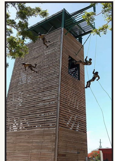
Up Park Camp, Jamaica