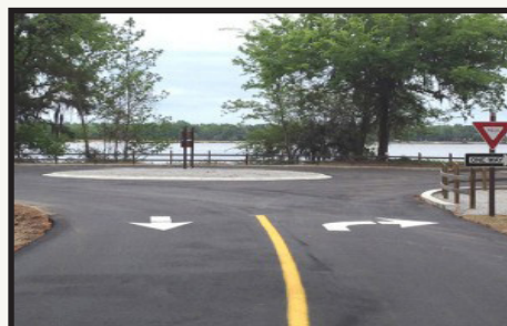
Santee NWS, Santee, SC