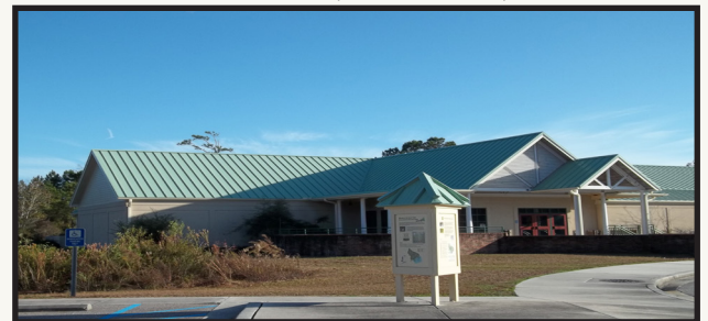
Cape Romain Visitor's Center, SC